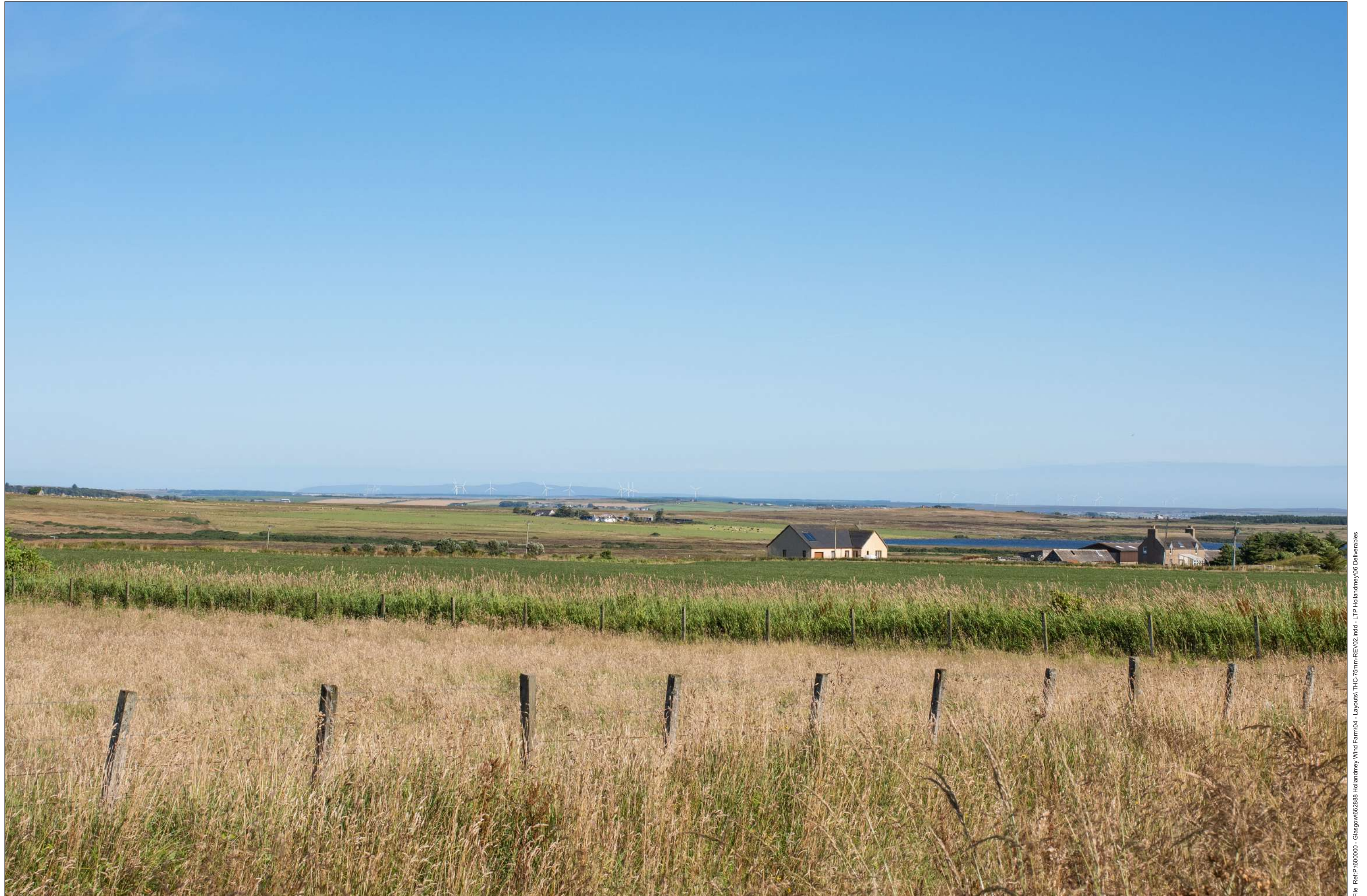
Figure: 7.34-THC-04 Viewpoint 21: Thrumster

This image should be viewed at a comfortable arm's length (Approx. 500 mm)