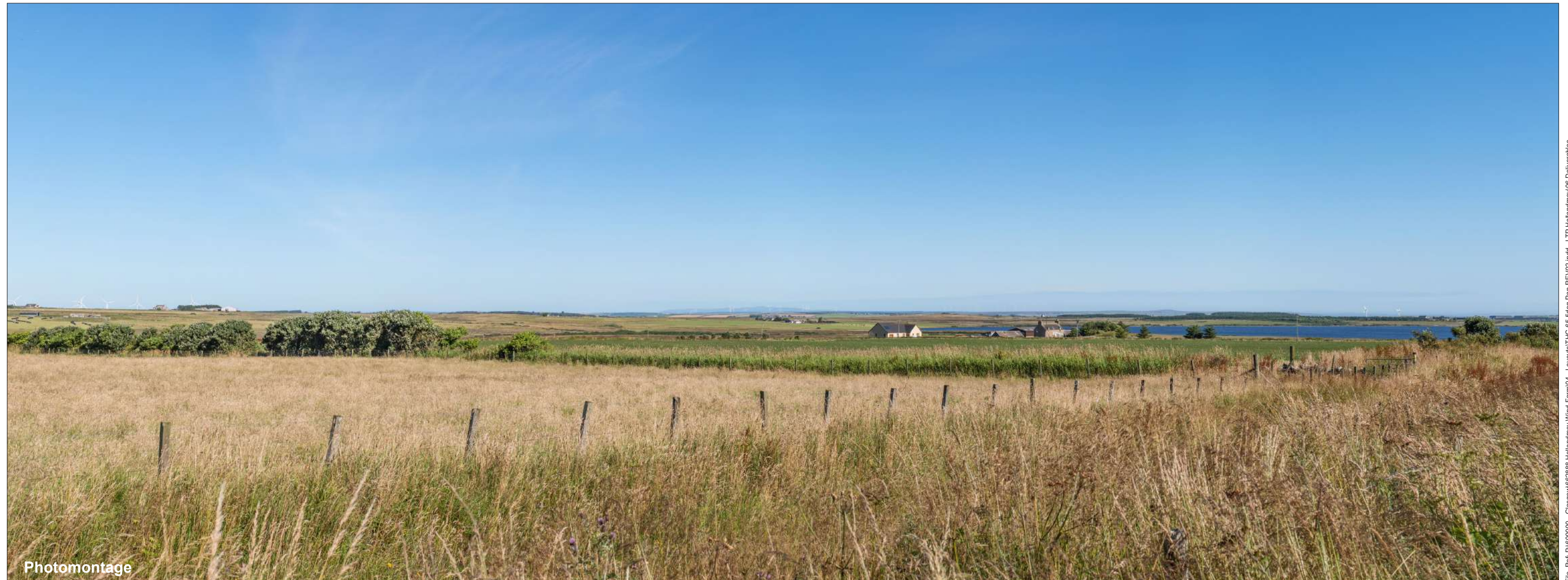
Figure: 7.34-THC-01 Viewpoint 21: Thrumster Photomontage: Planar Projection