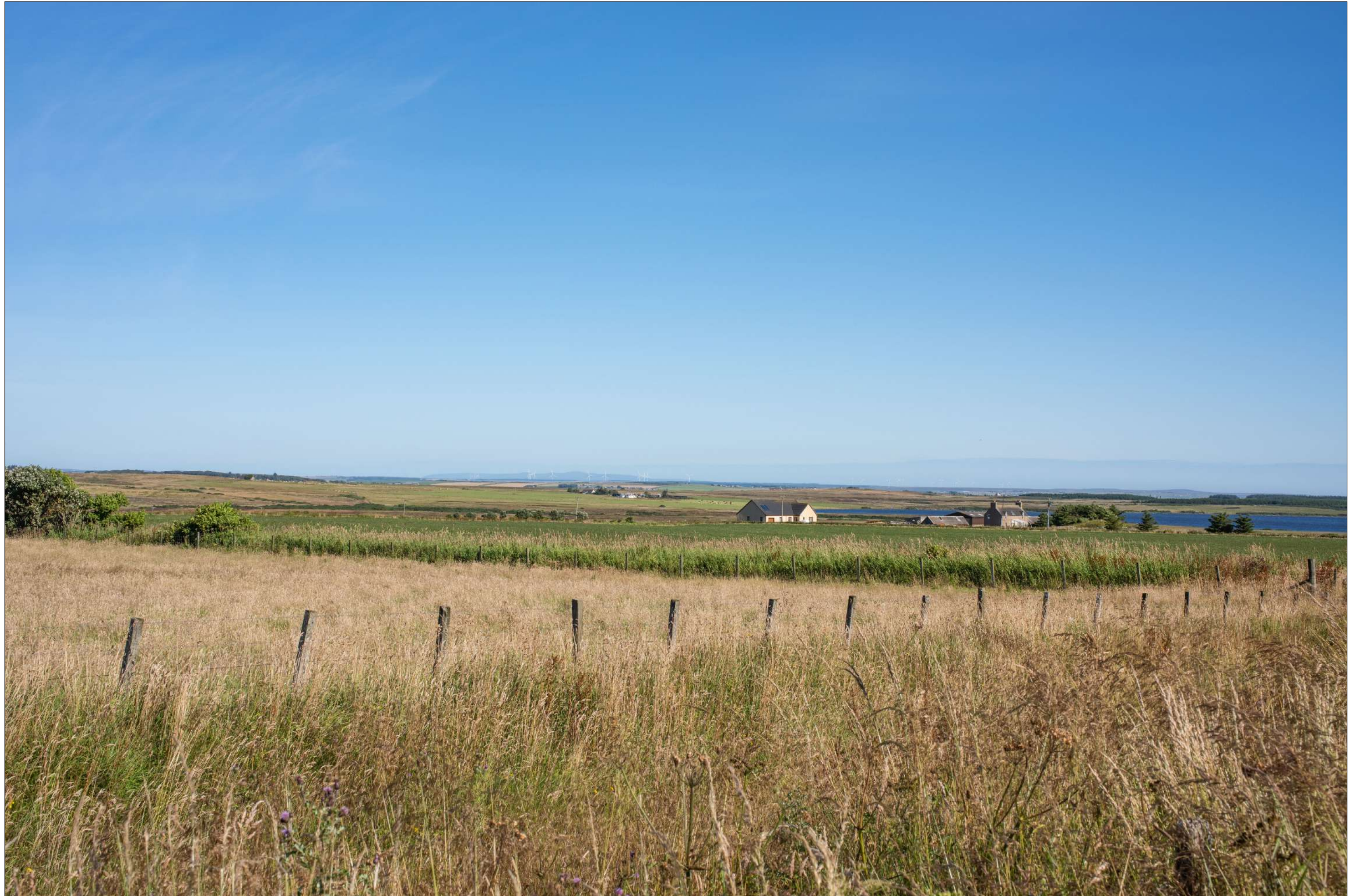
Figure: 7.34-THC-03 Viewpoint 21: Thrumster

When viewed at a comfortable arm's length (approx. 500 mm), this printed image is representative of our detailed central vision, but is not representative of scale and distance.